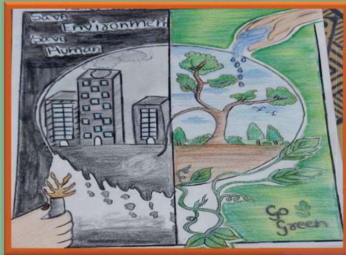
SAIMA M HINGALAWALA – 1 st STD VIII